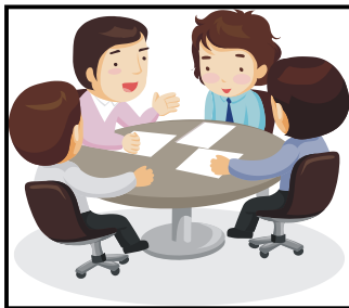
Decisions, Discussion and debates