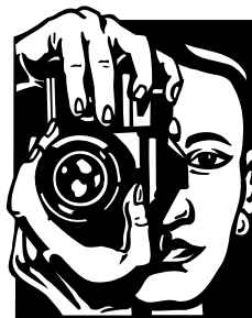
Photography and film