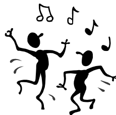
Dance and Musical Theatre