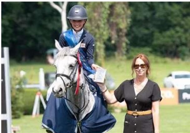
Support and Encourage

Why not give it a social arm also, whereby Communitiers might hold events or Discos etc"; sounds like a winner, good, all you need to do is volunteer and help make a difference!