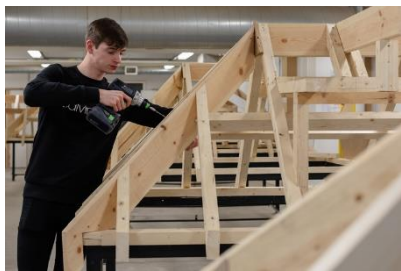
Apprentice's workshops - Carpentry