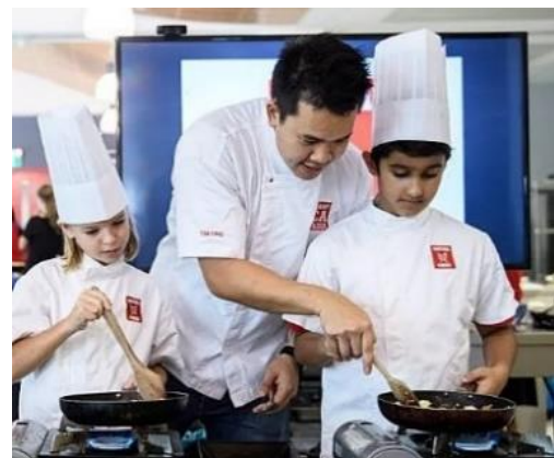
Share skills and Mentor