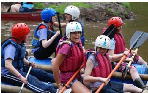
The Duke of Edinburgh's Award