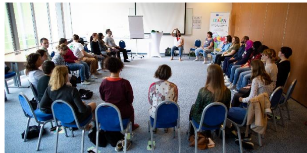
Forums and debates