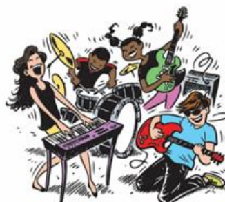
Form a Band

This Bulletin is a collaboration between the North Baddesley Parish Council and Sustainable Communities.