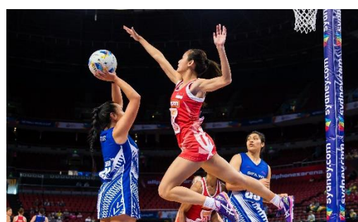
Netball with England Netball