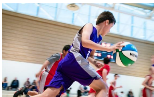
Basketball with SportSkool