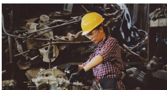
Employment Training and Skills